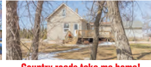
Country roads take me home! Mins from perimeter $254,900 - Matt