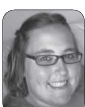
DISTRIBUTION Christy Brown