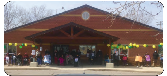
Elders gathered outside the Fisher River Cree Nation Personal Care Home with signs and balloons greeting those who took part in a drive-by parade on April 21.