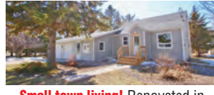
Small town living! Renovated in Argyle $239,900 - Matt