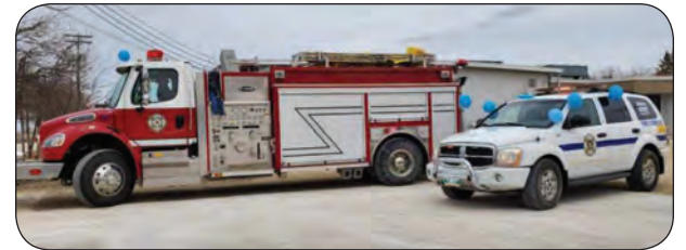
The Arborg fire department and ambulance service led the parade through town visiting the Assisted Living Centre.

"I know how much these little things mean to the people who live there. This could be the highlight of their month. I'm thinking about them a lot. ... It's worth it to see their smiles."