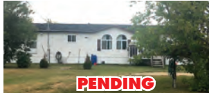
Eriksdale - Brandt