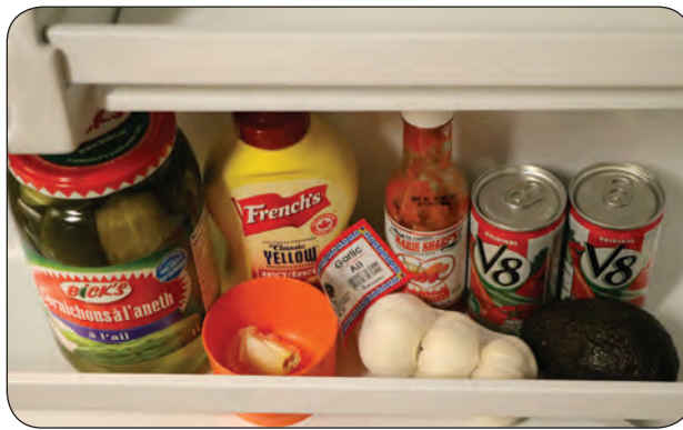
Garlic keeps for months on the door of your fridge, but it can't kill COVID.

Not so fast, says the WHO. Some lab tests have shown "very low levels of neutralizing antibodies" in people's blood, according to its April 24 scientific brief. More importantly, no study, thus far, has evaluated how effective those antibodies are in staving off another COVID infection or how long those antibodies last. Complicating the matter further is the unreliability of the lab tests, which may "falsely cat-