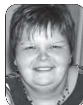
PRODUCTION Nicole Kapusta