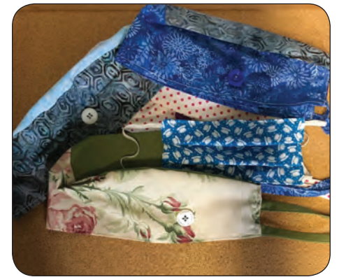
Handmade Gimli's crafters have made scrubs, masks and button bands.

them free of charge for anybody who says they need one.