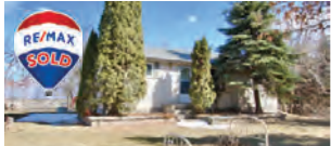
Rm of Rockwood - Brandt