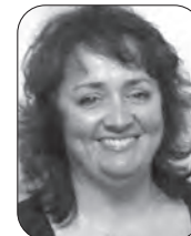
PRODUCTION Debbie Strauss