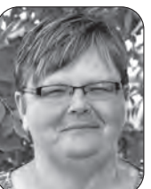
PRODUCTION Nicole Kapusta