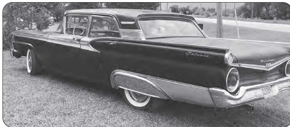
The 1959 Ford Galaxy will be one of the many cars on display for the Show ‘n Shine.

at the fire hall with a safety educator and a variety of other activities with the rec director from 11:30 a.m. to 5:30 p.m.