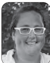
DISTRIBUTION Christy Brown