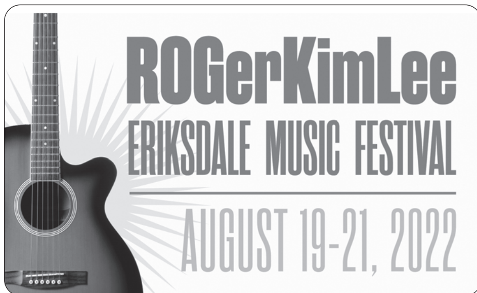
The ROGerKimLee festival honours three music lovers who passed away in 2020.

There will be music on the outdoor stages with an open mic segment, and kids’ activities, such as interactive projects for fire and bicycle safety