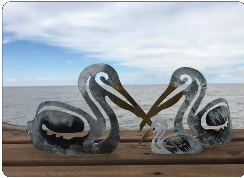
EXPRESS PHOTO SUBMITTED

The ornaments are "small enough that they go into a Christmas card, and they've become popular for trav-