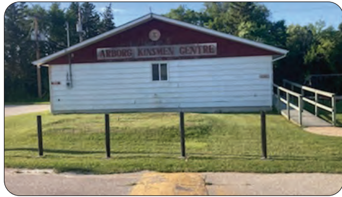
The Kinsmen building will be moved from its present location beside a park onto a foundation beside the Age Friendly building.

Local businesses donated about $30,000 and more is ex-