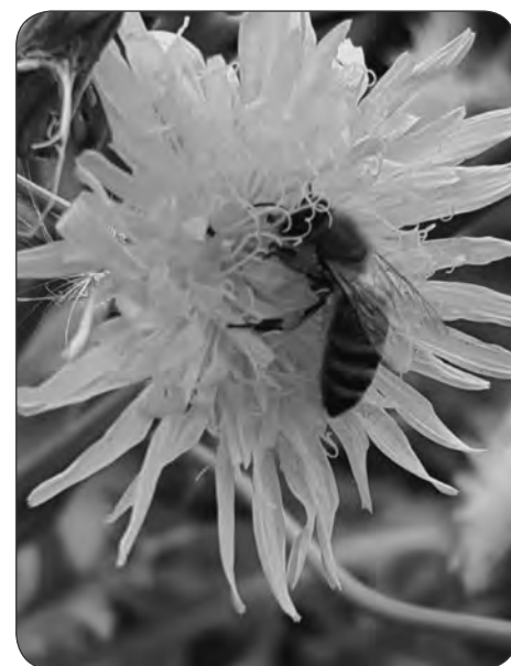
A honeybee collecting nectar.

On the other hand, insecticides are bad news for bees, so go organic if you need to use them, and refrain altogether when possible. Bug zappers are deadly too, so please consider