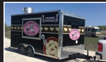
Minnie's Handmade Ethnic Treat food truck available at the fair!