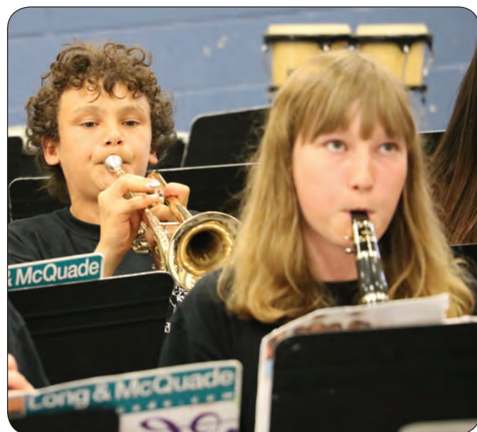
Nighthawk was the featured piece for the Grade 8 band.