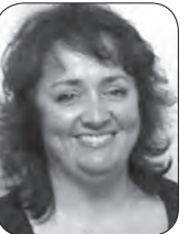
PRODUCTION Debbie Strauss