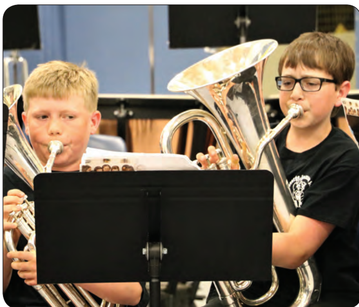
Dr. George Johnson Middle School Grade 8 students perform The Silver Scepter.