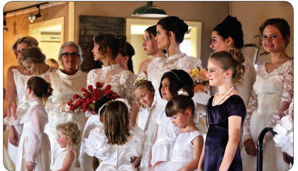
Sixteen models and 12 flower girls participated in the first-ever wedding show at Farmers Hall on May 27.

The hall's next wedding event will be a pop-up wedding ceremony on Sept. 22, Klym said. For more information, visit the Farmers Hall website at farmershallgimli.com .