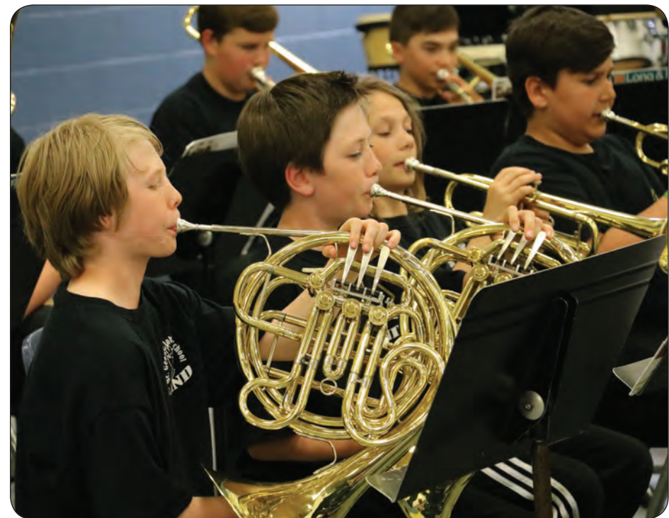
Dr. George Grade 7 students perform Cowboy Cattle Drive.