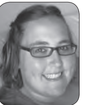
DISTRIBUTION Christy Brown