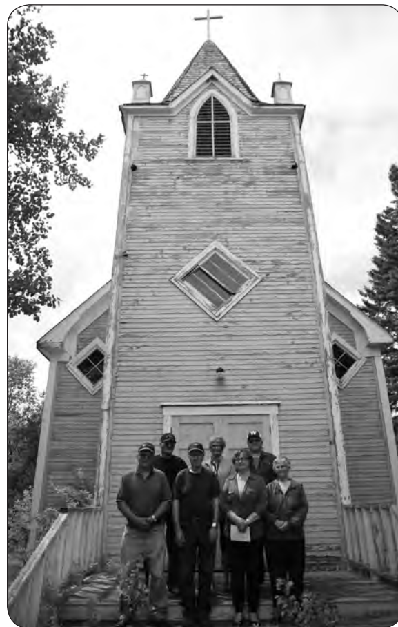
St. Paul's Evangelical Lutheran Church exterior elements define the building's Lutheran architectural character.

"The church is part of our local history and we want it to be preserved for future generations. It's a lot of