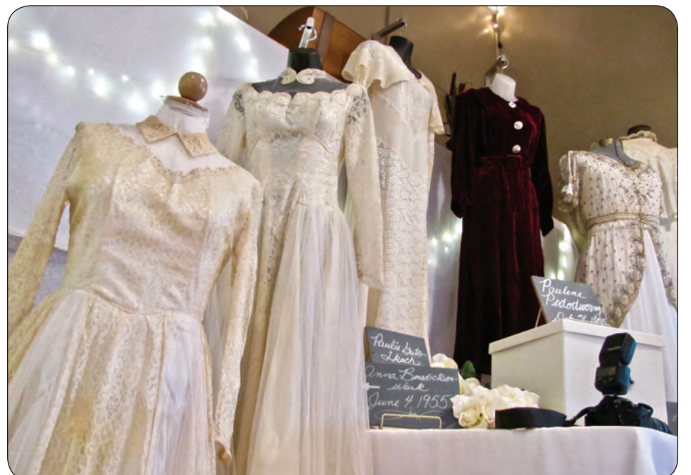
The wedding show at Farmers Hall showcased 66 wedding dresses from 1909 to 2017 at the event on May 27.