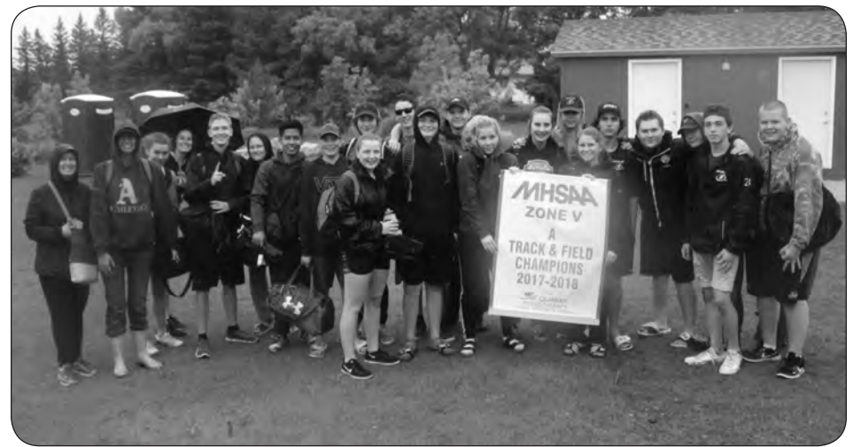
Arborg Collegiate's Athletics finished in top spot to win the MHSAA Zone 5 Track & Field 'A' banner on May 29.

"ARBORG IS POISED TO TAKE THE MEET OVER NEXT YEAR. THEY'RE READY TO TAKE THE NEXT STEP AS ZONE LEADERS."