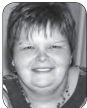
PRODUCTION Nicole Kapusta