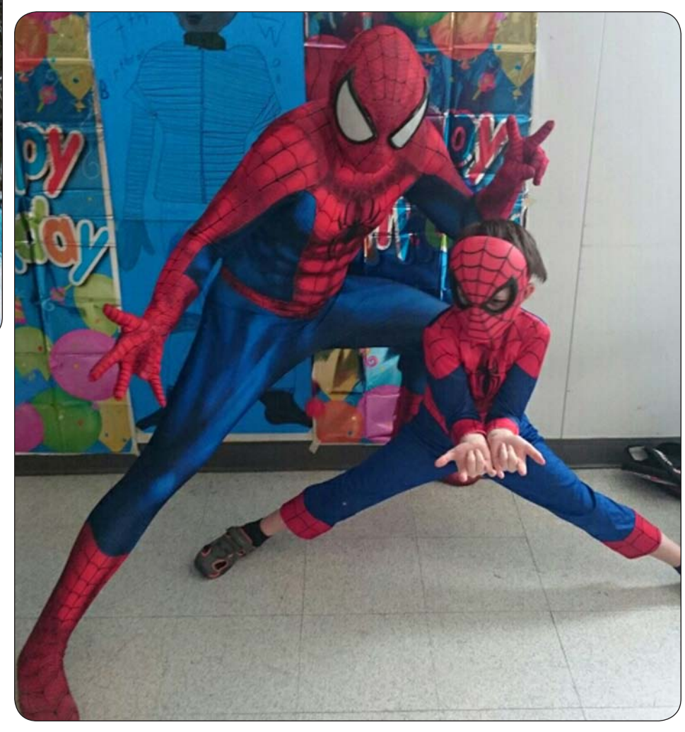
EXPRESS PHOTO SUBMITTED