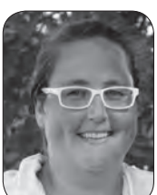
DISTRIBUTION Christy Brown