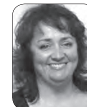
PRODUCTION Debbie Strauss