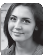
REPORTER/PHOTOGRAPHER Nicole Brownlee