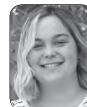
REPORTER/PHOTOGRAPHER Becca Myskiw