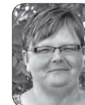
PRODUCTION Nicole Kapusta