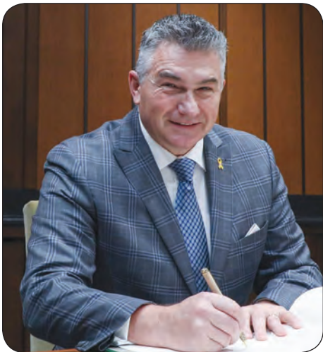
MP James Bezan

words of encouragement as we start another year in the midst of the pandemic.