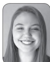
REPORTER/PHOTOGRAPHER Sydney Lockhart